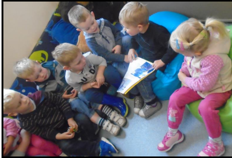
Sharing photographs from home

Children are able to enjoy painting, craft, sorting and selecting, play dough, construction, role play and imaginative play, messy and sensory activities, puzzles, mark-making, gardening, cooking, water and sand play...the list is endless!